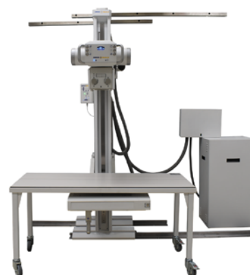
Optional Mobile Table