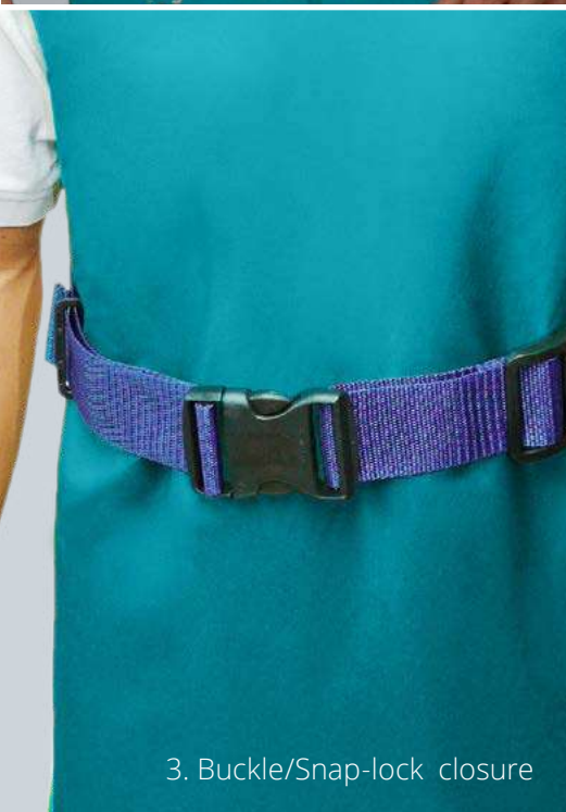
3. Buckle/Snap-lock closure