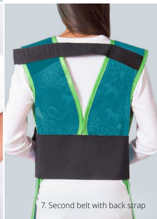
7. Second belt with back strap