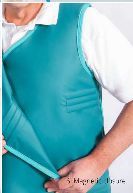
6. Magnetic closure