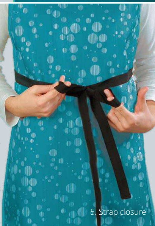
5. Strap closure