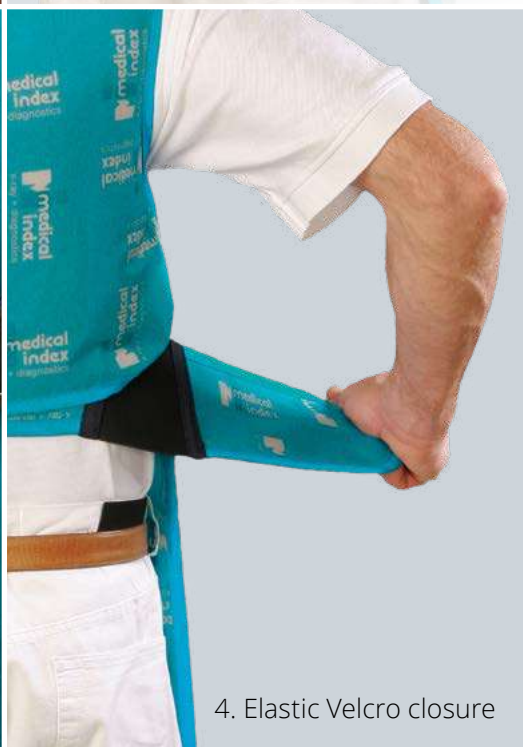
4. Elastic Velcro closure