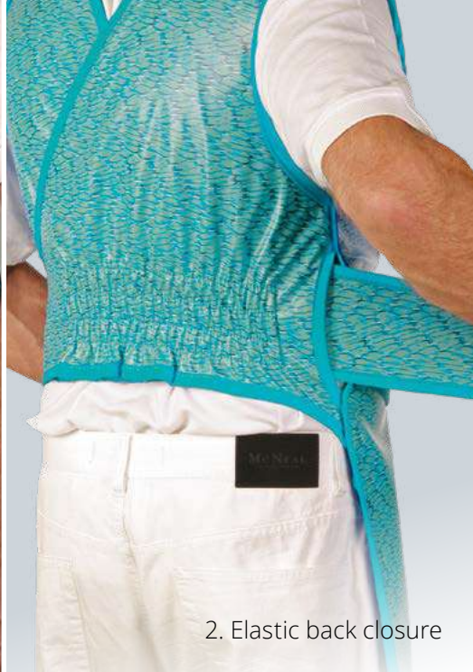
2. Elastic back closure