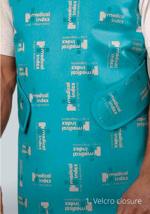
1. Velcro closure

An additional shoulder Velcro closure is also possible for fastening types 1 to 4.