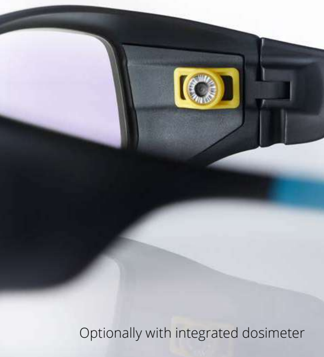
Optionally with integrated dosimeter